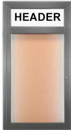
22" x 28" Enclosed Poster Case with Interior LED Lighting