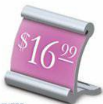
MOUNTED BASES COME IN SILVER & BLACK FINISHES