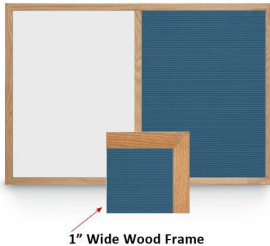
1" Wide Wood Frame