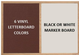
YOU CAN CHOOSE EXACTLY HOW YOU WANT YOUR COMBO BOARD TO LOOK!