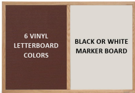
YOU CAN CHOOSE EXACTLY HOW YOU WANT YOUR COMBO BOARD TO LOOK!