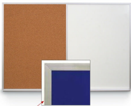
1/2" Wide Silver Trim Frame