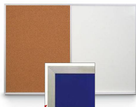
1/2" Wide Silver Trim Frame