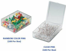
RAINBOW COLOR PINS (100 Per Box)