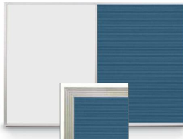
1/2" Wide Silver Trim Frame