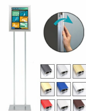
SINGLE or DOUBLE SIDED