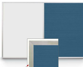
1/2" Wide Silver Trim Frame