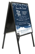
Security Screws Included

*A-Frame Stands are ideal for indoor use. If you decide to place outdoors, the metal finish is suitable for inclement weather.