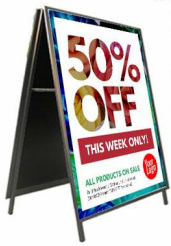
Security Screws Included