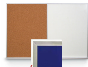
1/2" Wide Silver Trim Frame