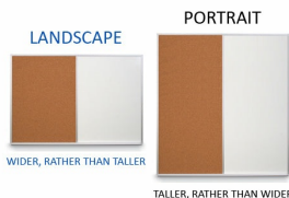
LANDSCAPE WIDER, RATHER THAN TALLER