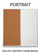
PORTRAIT TALLER, RATHER THAN WIDER