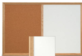
1 1/8" Wide Decorative Wood Frame