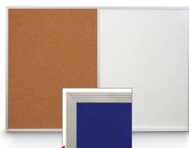
1/2" Wide Silver Trim Frame