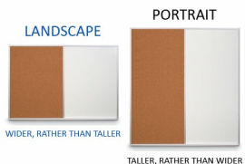
LANDSCAPE WIDER, RATHER THAN TALLER