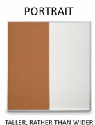
PORTRAIT TALLER, RATHER THAN WIDER