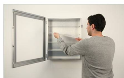
ADJUST YOUR SHELVES AS NEEDED