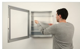
ADJUST YOUR SHELVES AS NEEDED