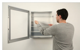
ADJUST YOUR SHELVES AS NEEDED