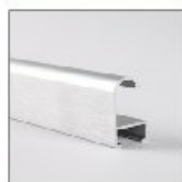
6 Metal Finishes (Satin & Polished)