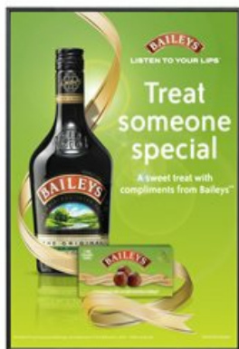
3/8" WIDE METAL FRAME