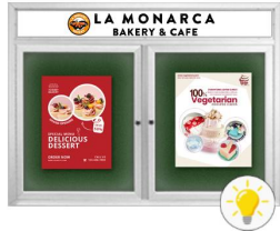
5" High Header