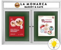
5" High Header