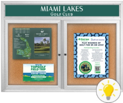
5" High Header

FOR CURRENT PRICING, VISIT THE ID # LISTED ABOVE