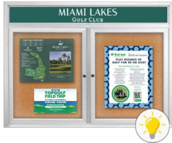
5" High Header