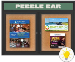
5" High Header