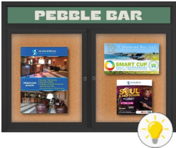
5" High Header

FOR CURRENT PRICING, VISIT THE ID # LISTED ABOVE