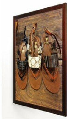
SLIM TO WALL PROFILE ONLY 7/8" DEEP