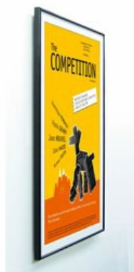
SLIM TO WALL PROFILE ONLY 1" DEEP