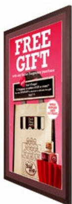
SLIM TO WALL PROFILE ONLY 3/4" DEEP