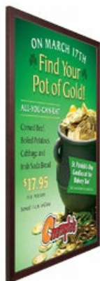
SLIM TO WALL PROFILE ONLY 3/4" DEEP