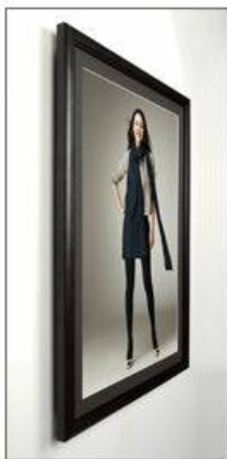
SLIM TO WALL PROFILE ONLY 1 1/8" DEEP