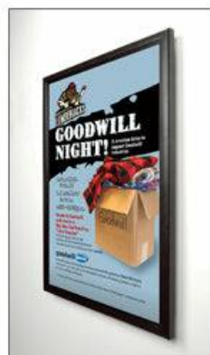
SLIM TO WALL PROFILE ONLY 1 1/8" DEEP