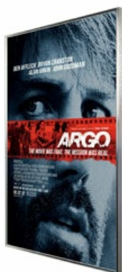
SLIM TO WALL PROFILE ONLY 1" DEEP