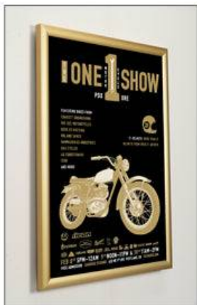
SLIM TO WALL PROFILE ONLY 7/8" DEEP