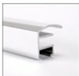
4 Metal Finishes (Black, Silver, Satin & Polished Gold)