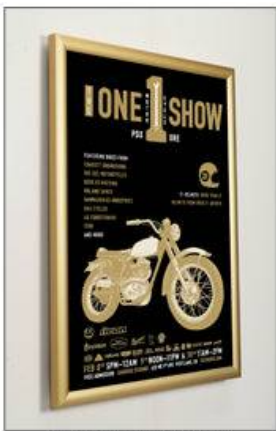
SLIM TO WALL PROFILE ONLY 7/8" DEEP