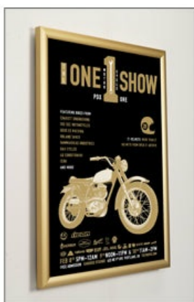
SLIM TO WALL PROFILE ONLY 7/8" DEEP