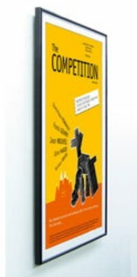
SLIM TO WALL PROFILE ONLY 1" DEEP