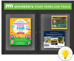
5" High Header