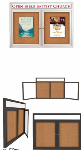
5" HIGH HEADER