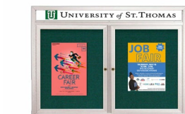
5" HIGH HEADER