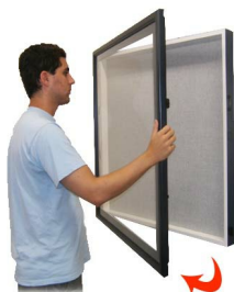
(OPTIONAL) CONCEALED LIGHTING

Custom shadow box sizes, custom shadow box frames, deep shadow box sizes, lighted shadow boxes, matboard colors, side locks for security, cork board backer, fabric backer, and optional shelves ( Call for Details )