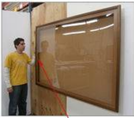
INTERIOR SIDES FINISH AVAILABLE IN WHITE, BLACK OR COMPLIMENTARY FRAME FINISH