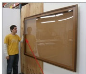
INTERIOR SIDES FINISH AVAILABLE IN WHITE, BLACK OR COMPLIMENTARY FRAME FINISH