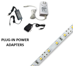
PLUG-IN POWER ADAPTERS

LONG LASTING, GREEN, ENERGY EFFICIENT LED COMPONENTS