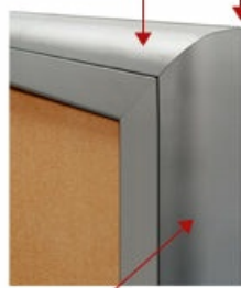
RADIUS EDGES on ALL 4 Sides Sleek and Contemporary Design