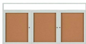
SECURITY CAM LOCK