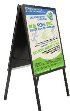
Security Screws Included