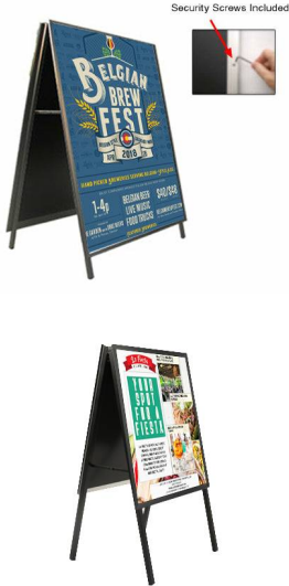
Security Screws Included

ALL 4 FRAME SIDES HAVE A SECURITY SCREW PLACED INTO THE CENTER OF EACH FRAME RAIL. THESE SCREWS SECURE THE SAFETY OF YOUR POSTING AND PREVENT ANY TAMPERING.