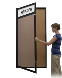
24 x 72 EXTRA LARGE Enclosed Bulletin Board