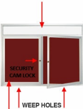
OPTIONAL VINYL COLORS (SHOWN IN BURGUNDY)