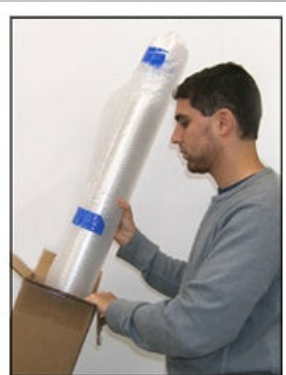
Sizes 24" x 36" and larger ship Unassembled