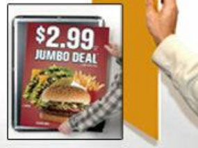
SECURITY TOOL PROVIDED