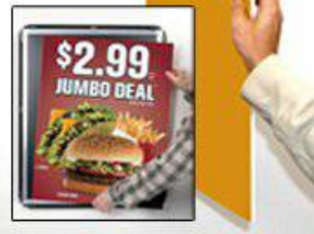
SECURITY TOOL PROVIDED