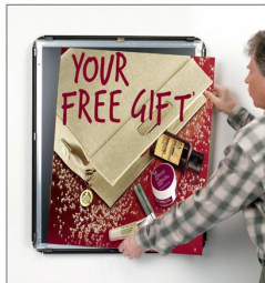
SECURITY TOOL PROVIDED