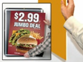
SECURITY TOOL PROVIDED