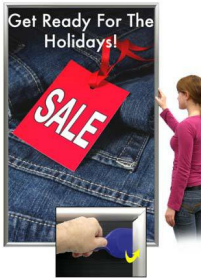
SECURITY TOOL PROVIDED

FOR CURRENT PRICING, VISIT THE ID # LISTED ABOVE FREE SHIPPING